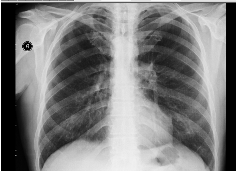
Figure 1 Bilateral hyperlucency is visible in this X-ray.

a double aortic arch. Normally, the left fourth arch regresses and forms the aortic arch. If the left fourth arch regresses and the right arch remains, this will result in a right-sided aortic arch. 3,4 Classically, DAA has three types; right dominant aortic arch, left dominant aortic arch, and balanced-type aortic arch. In 75% of the cases, the right arch is dominant and in