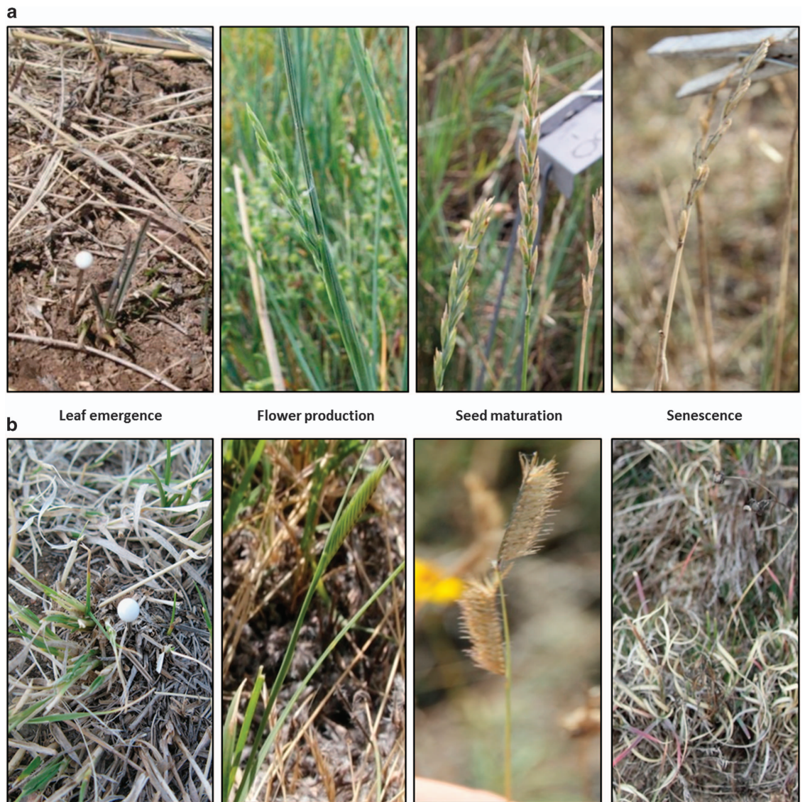
Figure 3. Pictorial index of plant phenophases for (a) C-3 grass ( Pascopyrum smithii ) and (b) C-4 grass ( Bouteloua gracilis ).

training by data observers and use of photographic plant guides for visuals of phenological stages for each species (Fig. 3 gives an example for two species). To ensure quality of data collection (i.e., observations), we also harvested sample specimens of each species from outside of the plots, archiving them in their vegetative and reproductive states to reference as needed. Samples were not collected for physical or chemical analysis of any kind. In 2010 and 2011, instead of following the same individual plants, the timing of an event was achieved when a minimum number of individuals for each species within a plot had completed a life history event, representing the median value. Despite this difference in approaches, both methods represented a central tendency to quantify event timing across multiple individuals per plot. We performed a direct one to one comparison of treatment means presented in Table 2 (available online only) for Method 1 (2007–2009) versus Method 2 (2010–2011) at each growth stage averaged across species for each method. A linear regression analysis plotting one method on the x-axis and the other on the y-axis against produced a R^2 value of .98.