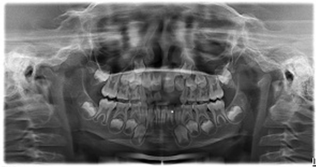
Fig. 6. Post op OPT showing absence of radioopaque mass and coronoidectomy on the right side.