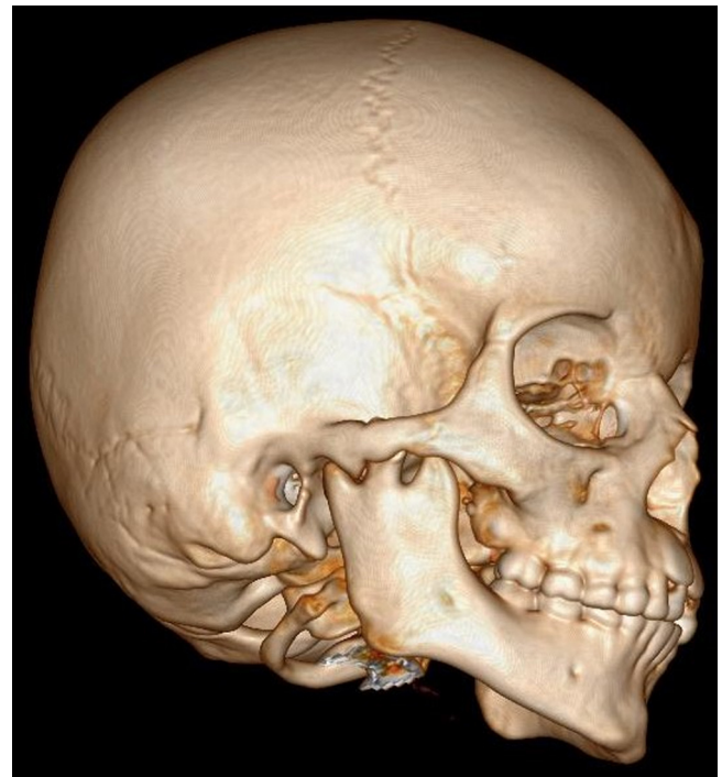
Fig. 3. Pre op 3D CT scan – Lateral/oblique view showing relationship of right condyle and deformed condyle to TMJ and Zygomatic arch.

For further elucidation, and owing to considerable distortion in regional osseous anatomy, computed tomography (CT) with 3D