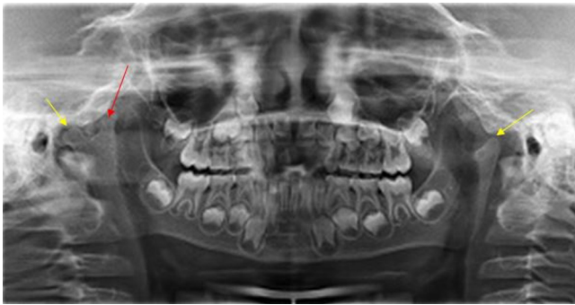
Fig. 2. Pre op OPT showing radio opaque projection in the sigmoid notch (Red arrow) and TM Joint space (Yellow arrow).

auto rickshaw (a public transport vehicle commonly used in India). At the time, he sustained lacerations to his forehead and chin. A little later, the boy developed mild swelling in the right preauricular region, which eventually resolved without any form of intervention. No history of loss of consciousness or bleeding from the ear or nose was reported. There were no other major injuries associated. His medical history was unremarkable. Primary care constituted wound debridement and closure of the forehead laceration at a local primary health centre. As time went by, the boy's father began noticing a progressive reduction in his son's ability to open his mouth (Fig. 1).