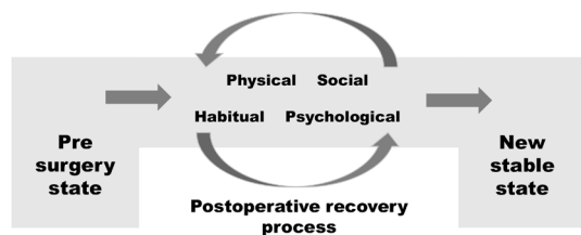
Figure 1 The process of postoperative recovery.

with a ‘new stable state’ (figure 1). Postoperative recovery is an individual process and a transformative journey, including how the physical, psychological, social and habitual dimensions affect each other in a continual and dynamic process that leads to a new stable state. This new stable state is not necessarily a state that is the same as that before surgery, or a return to presurgical functions. In many cases, the surgery itself was done to improve mobility and to reduce or remove dysfunctions. For example, some participants described how they were now able to do activities that were impossible before the surgery. For these participants, the new stable state was experienced as being more functional than the preoperative state. In other cases, such as when patients could not return to work, the new stable state involved adjusting to a state with a permanent decrease in or loss of preoperative functions.