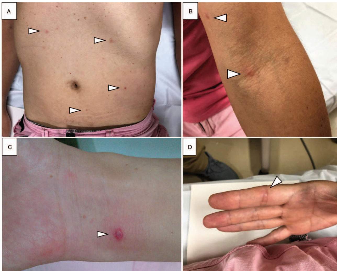
Figure 1. Skin manifestations of disseminated gonococcal infection. There were red papules on his trunk and extremities (A and B), an impetigo-like pustular lesion on left forearm (C), and tendinitis at proximal interphalangeal joint of right forefinger (D).

A 51-year-old man who experienced an acute-onset high fever presented to us. His past medical history included spontaneous pneumothorax, tonsillectomy, and Wolff–Parkinson–White syndrome. At the presentation, there was no respiratory, gastrointestinal, or urinary symptoms. He denied any previous history of repeated or refractory infectious episodes. His vital signs were as follows: body temperature, 38.8°C; blood pressure, 115/56 mm Hg; heart rate, 110 beats per minute, sinus, and oxygen saturation, 99% on room air. Physical examination revealed red papules on his trunk and extremities (Fig. 1A, B). A pustular lesion on right forearm showed an impetigo-like appearance (Fig. 1C), and the patient complained tendinitis at proximal interphalangeal joint of his right forefinger (Fig. 1D). Laboratory tests showed elevations of peripheral white blood cells (17,300/ \mu L), serum C-reactive protein