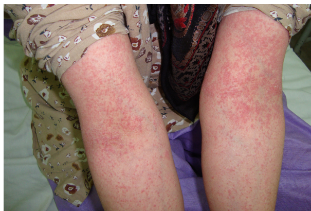
Figure 1 A 25-year-old woman with the diagnosis of acute generalized exanthematous pustulosis following the use of cephalexin.

In patients with a diagnosis of fixed drug eruption induced by trimethoprim-sulfamethoxazole (34 patients), most lesions were present in the genital area (18 patients). Five patients had lesions in both the genital area and the lip, and only one patient suffered from a lesion present only on the lip. The remaining patients had lesions in other areas,