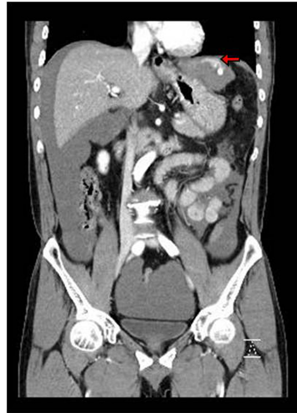
Figure 2 Abdominal CT shows diaphragm invasion of the mass like lesion (arrow).