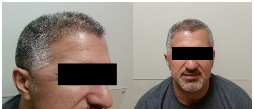
FIGURE 4: Office follow-up cosmetic outcome

To accomplish this, these sheets were layered with the thickest point just posterior to the orbit and just superior to the zygoma, and the thinnest point at the posterior and rostral margin. The margins were then sutured to soft tissue just posterior to the orbital ridge at the level of the galea, and soft tissue just rostral to the ear at the level of the zygoma. The scalp was reflected back, and the appearance of symmetry was demonstrated. At clinical follow-up, palpation posterior to the orbital ridge demonstrated that the hollowing out that had been previously present, was now filled out well (Figure 4).