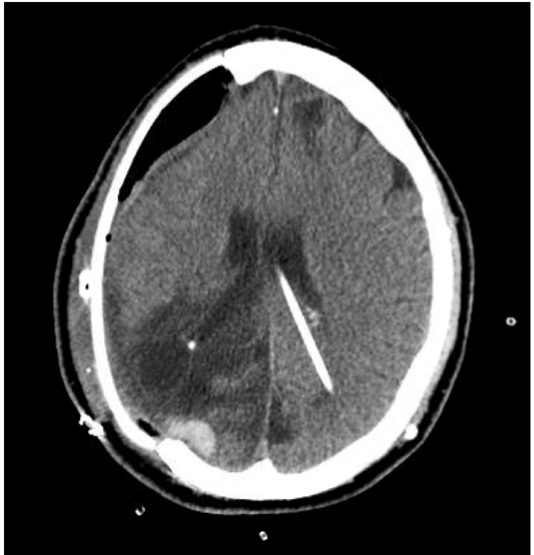
FIGURE 2: Primary cranioplasty surgery post-op CT imaging