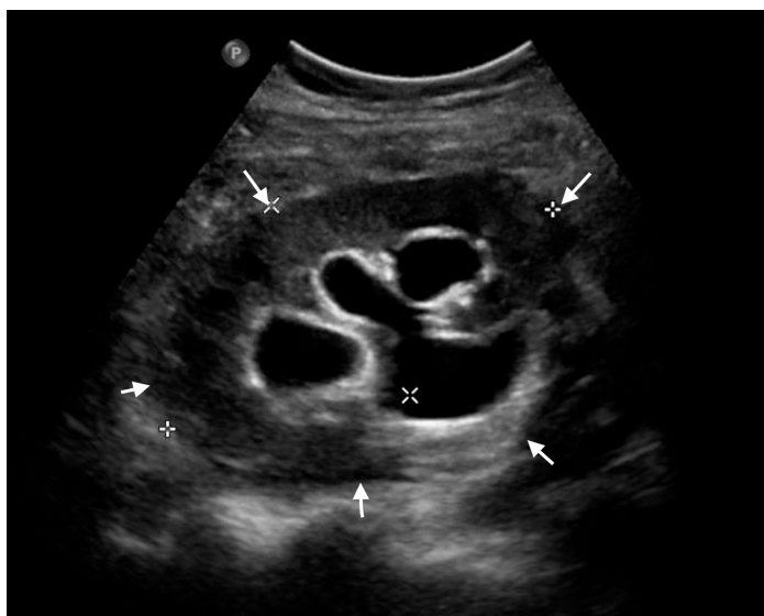
FIGURE 1: Ultrasound of transplanted kidney

The initial ultrasound of the transplanted kidney showed normal echogenicity and cortical thickness without any peri-graft collections. There was no evidence of any anastomotic stenosis, and all duplex parameters were normal. Mild hydronephrosis of the transplanted kidney with suboptimal distention of urinary bladder was seen. No definite calculus was identified. The same imaging was repeated after two weeks as there was persistent pus discharge from the surgical site. It showed two echogenic foci of size 4 mm in the lower pole of the transplanted kidneys, representing parenchymal calcifications or stones. Multiple, small, poorly localized fluid pockets were noted in the right iliac fossa along the subcutaneous plane of the surgical site, largest measuring 1.5 cm x 0.7 cm. In conclusion, there were new-onset parenchymal calcifications associated with peri-graft collection communicating with the outside as sinus (Figure 1).