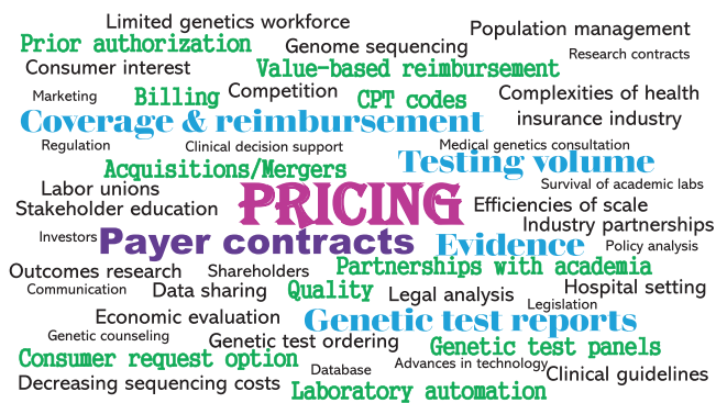
Fig. 2 Word cloud illustrating the 48 unique topics identified. The size of font is directly proportional to the number of times a topic was mentioned across the six domains assessed. The domains included (1) laboratory business models, (2) factors influencing laboratory business models, (3) laboratory business practices, (4) factors influencing laboratory business practices, (5) the evolution of business models, and (6) research ideas to improve availability of and access to germline testing. Pricing was most common topic, followed by payer contracts, coverage and reimbursement, testing volume, evidence (of clinical validity, clinical utility, personal utility, and economic value), and genetic test reports.