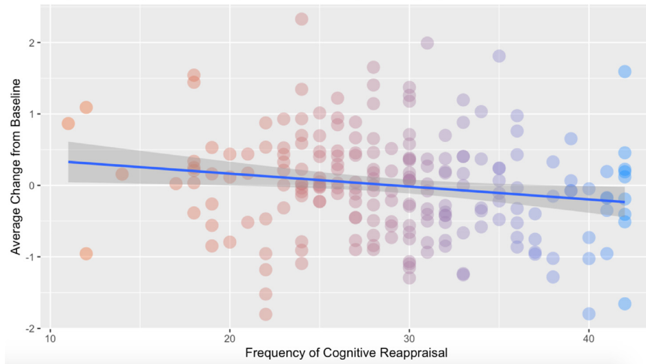
Fig. 1. Average change in nasal cytokine production from baseline for those infected with rhinovirus based on self-reported frequency of cognitive reappraisal.

reappraisal did not predict who became infected with rhinovirus ( p = .26 ), nor did self-reported use of expressive suppression predict who became infected with rhinovirus ( p = .83 ).