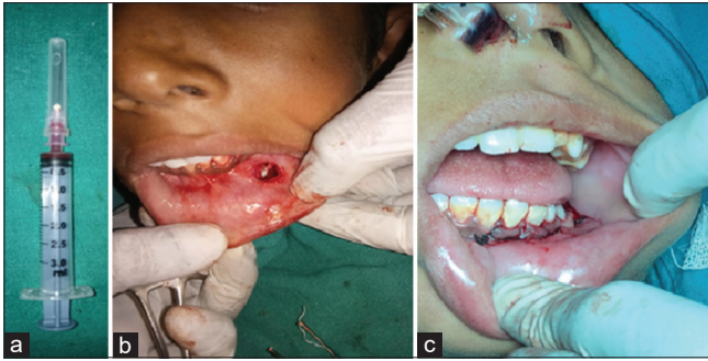
Figure 3: (a) Aspiration fluid. (b): Window created in the buccal cortical plate. (c): Postoperative photo showing closure of surgical site with sutures