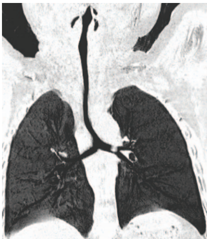
Figure 1. Three-dimensional CT image showing near total occlusion of the left main bronchus and left lung emphysema, a mild degree of tracheal stenosis, and abnormally low tracheal bifurcation at T6 level.