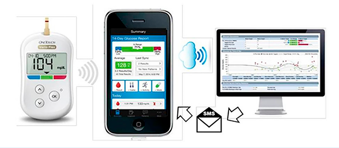
FIGURE 2 Subject data flow. Test (baseline to week 24) and control (week 12 to week 24) subjects used the OT Verio Flex meter to conduct BGM according to the schedule suggested by their HCP. BGM data were transmitted wirelessly from the meter to the smartphone containing the Spanish-language version of the diabetes management mobile app OT Reveal. BGM data were automatically uploaded via the Cloud to a Web-based version of the app accessible to the HCPs on their office computers. HCPs reviewed the 14-day Web-based report for each subject to assist in formulating diabetes-related text messages sent to the subjects' smartphone.

had type 2 diabetes, and 95% were of Hispanic or Latino ethnicity. Nearly all had never used diabetes management software or had their HCP download their blood glucose data from their meter. More than half of the subjects had either no formal education (16%) or only primary school education (50%); 32% had some secondary or technical school training, and only 2% had some college education. More than half of the subjects listed home management (33%); farming, fishing, and forestry (11%); or construction/maintenance (8%) as their occupation. Sixty percent of patients were on oral medication, and the remainder were using mealtime or basal insulin. Seventy of the 120 subjects were provided smartphones. Loading of the app on the phone was done by clinic staff in about 85% of the cases. Synchronizing of blood glucose data were automatic each time the subject opened the app.