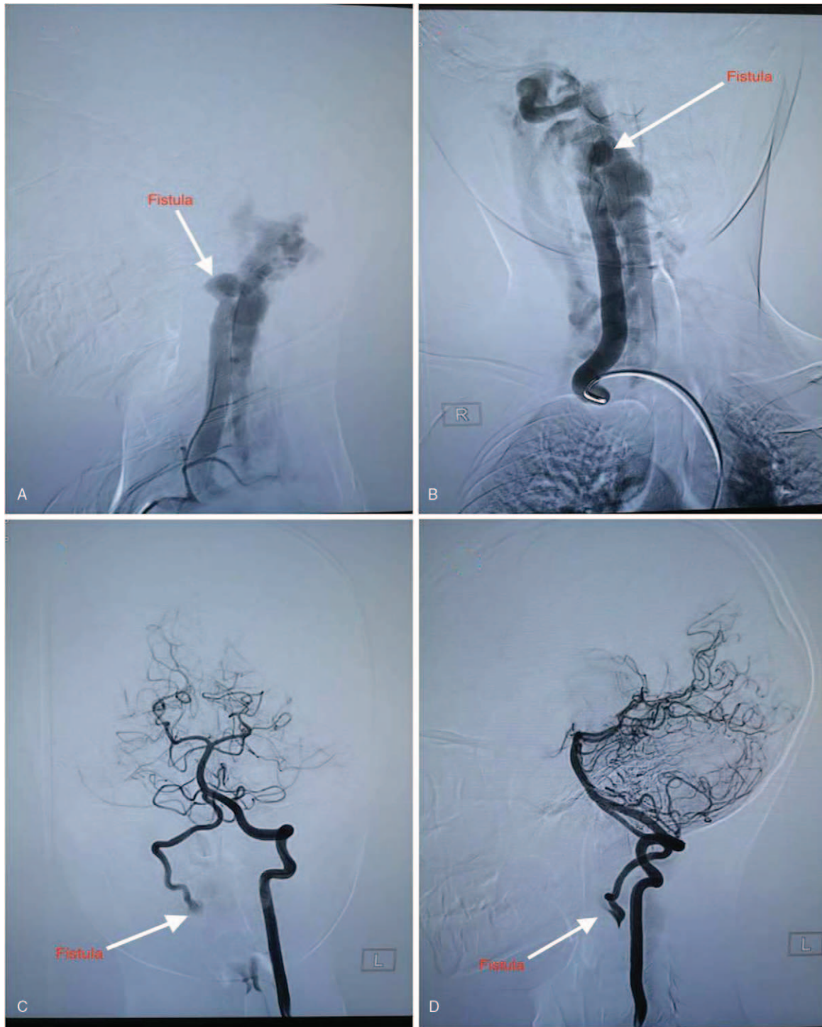
Figure 1. A and B are preoperative digital subtraction angiogram (DSA) images showing the lateral and anteroposterior views of right vertebral artery. C and D are preoperative DSA images showing the anteroposterior and lateral views of left vertebral artery.

blood flow from the V3 segment of the vertebral artery (Fig. 1A–D). No further arterial supply was found except the vertebral artery. The venous drainage was via a complex venous plexus of epidural and paraspinal veins. We noticed during our evaluation that preservation of both the distal and proximal vertebral artery via endovascular obliteration would not result into severe complications owing to none contrast filling at the right distal vertebral artery. We also observed that the contralateral