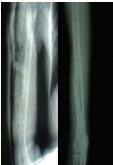
FIGURE 2: X-rays with U-splint and just after removal.

following brace removal (Figure 3). No patient had radial nerve palsy during treatment or due to entrapment in the callus of healed fracture.