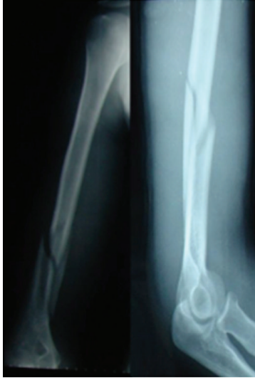
FIGURE 1: X-rays at the first application to the emergency service.