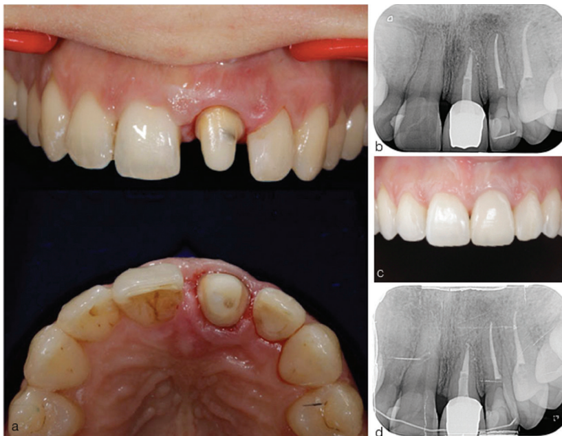
Fig. 3: (a) Crown preparation (b) post-operative radiograph (c) post-operative labial view (d) radiograph taken after 4 years of treatment.