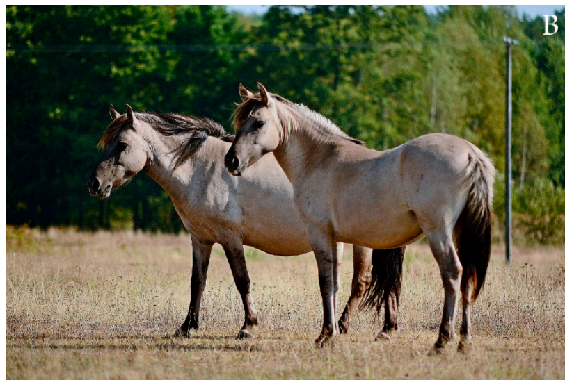
Figure 1. (A) Polish Konik; (B) appearance of Polish Konik.

Due to maternal and paternal line analyses indicating that their uneven representation (according to Jaworski (Jaworski, 1997 in [17])) [17] and the relatively small population of Polish Konik horses, the genetic variability of this breed should be monitored, especially given that their present genealogical statistics are unknown. Polish Konik horses, which are unique, natural-breeding relicts, must be preserved as a specific reservoir of genetic resources for future breeding work [8]. Parentage control has been provided for all Polish Konik horses in Poland since 2009 [13] according to International Society for Animal Genetics (ISAG) recommendations [18].