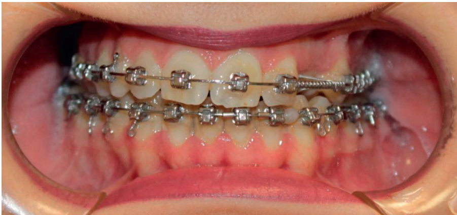
FIGURE 3: Patient occlusion 1 year after surgery.

As refinements, genioplasty and lipofilling procedure was performed.