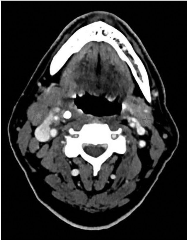
Fig. 2 – Axial neck CT scan with IV contrast approximately 17 days following reported symptom onset. Demonstrates bilateral upper jugulodigastric lymphadenopathy (blue stars).

induce an immune response causing systemic symptoms, including headache, a generalized rash that commonly affects the palms and soles, malaise, pyrexia, and condyloma lata. The rash is the most common symptom, occurring in 90% of patients and often beginning as a copper-red macular rash before the papules develop [5]. Lymphadenopathy and a painful sore throat can also develop with secondary syphilis but are less common symptoms [2]. Secondary syphilis will also resolve without treatment; however, approximately one-quarter of patients will develop a recurrence in 4 years if untreated [5]. Finally, if treatment has not been pursued with curative antibiotics, tertiary syphilis can occur years after primary syphilis. Any organ or tissue can be invaded by the treponemes and cause inflammation due to the hypersensitivity response. This results in the formation of gummas, which are granulomatous lesions in the skin, mucosa, and bone, as well as neurosyphilis and cardiovascular syphilis [5].