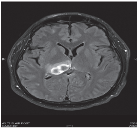
FIGURE 2: T2 flair MRI brain with contrast showing a 3 cm multiloculated cystic lesion (abscess) over the posterior thalamus with surrounding edema.

neurosurgery again determined drainage to be too risky. Ceftriaxone and metronidazole were discontinued. Meropenem was started and vancomycin was continued. His serum glucose became well-controlled with the use of basal bolus and prandial insulin. On day 9, he was transferred to a university hospital where MRI demonstrated increasing reach of the infectious material to the posterior third ventricle and into the contralateral thalamus, and again no ventriculitis or ependymitis was appreciated. The following day, the patient was taken to the operating room for neurosurgical intervention. An entry point just above the transverse sinus in the temporal occipital region was planned. A single bur hole was made, and a needle was inserted along the preplanned trajectory. Evacuation via biopsy syringe revealed frank pus. The procedure was tolerated without complication. No identifiable organism was isolated in the aspirate despite ribosomal sequencing. Dentistry was consulted and evaluated for dental infection and found no evidence of abscess or periodontitis. He was discharged on IV vancomycin and ampicillin-sulbactam for four additional weeks to complete a total antibiotic course of six weeks. Significant improvement was observed on repeat MRI four weeks and then twelve weeks after discharge. He