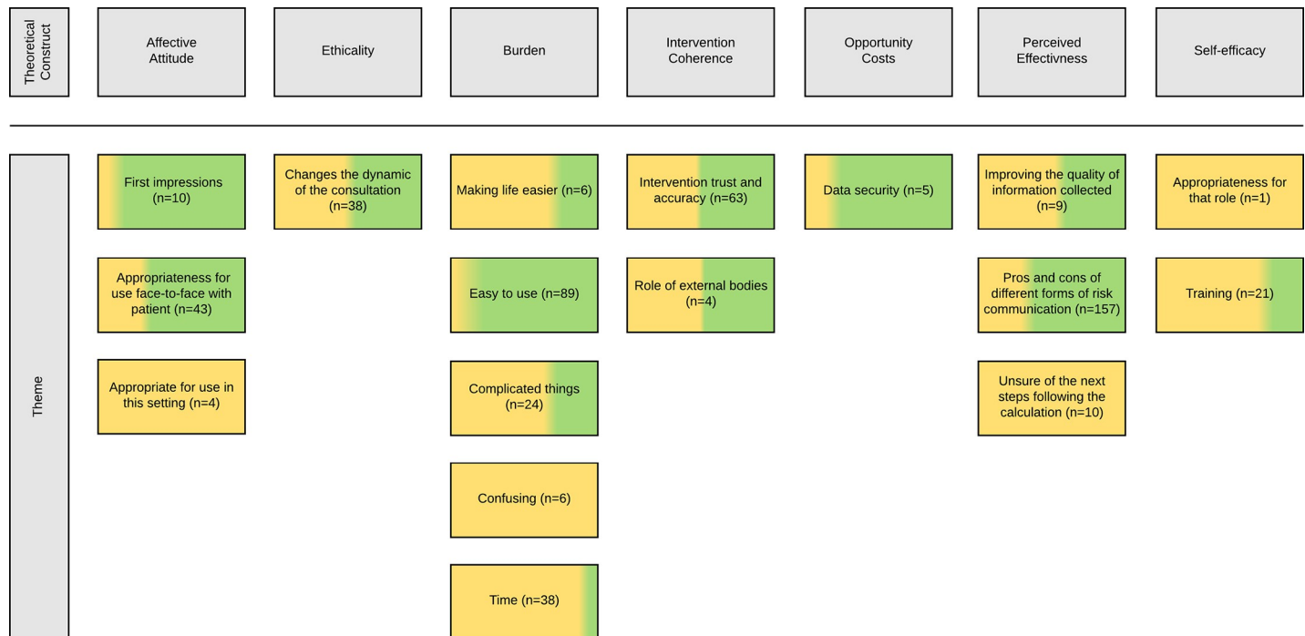
Fig 4. Inductive themes mapped onto Sekhon et al's Theoretical Framework of Acceptability [12]. The total number of times the theme occurred is presented after each theme name (e.g. n = x). The yellow (primary care) and green (specialist genetics clinic) colouring shows the proportional contribution of each sample to the theme.

https://doi.org/10.1371/journal.pone.0229999.g004