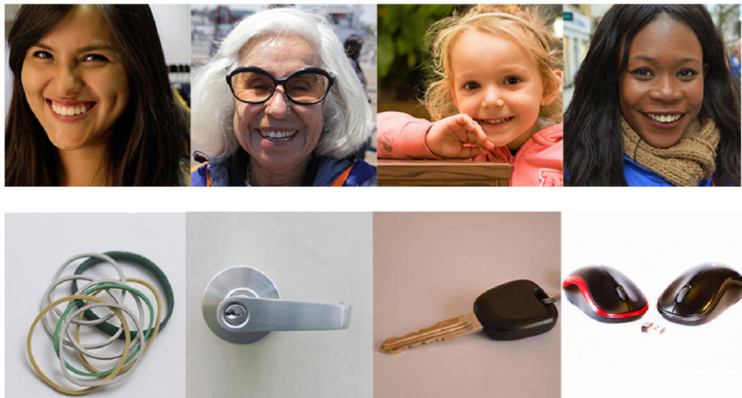
FIGURE 1 | USs+examples on the top line, USsNexamples on the bottom line.

For the EC condition, we designed a brief game-like app, inspired by the app designed by Franklin et al. (2016). In our study, each game session began with the presentation of three different pairs of photographs that the participant was instructed to remember. Pairs were composed of one CS and one US+. CS-US+ associations were randomly determined by the app at the beginning of each session. During the game, at each trial, one of these three pairs appeared among distractor photographs. The participant's task was to select these pairs as quickly as possible. Distractor photographs corresponded to other USs+. Each game session contained 60 trials. At the end of each trial, the participant received feedback about the accuracy of the response (a red or green screen for 100 ms). Every 15 trials, the game became harder as more distractors were added and other response options were blacked out when the first option was selected (see Figure 2 ). Points were awarded for fast and accurate responses; this score was displayed at the end of each session. Thus, at each trial, participants associated an image of their body and a specific US+ by successively selecting a photograph of their own body and the target US+ (sequential pairing). Moreover, each time a participant saw a photograph of their own body, this was accompanied by other USs+ (distractors) on the screen