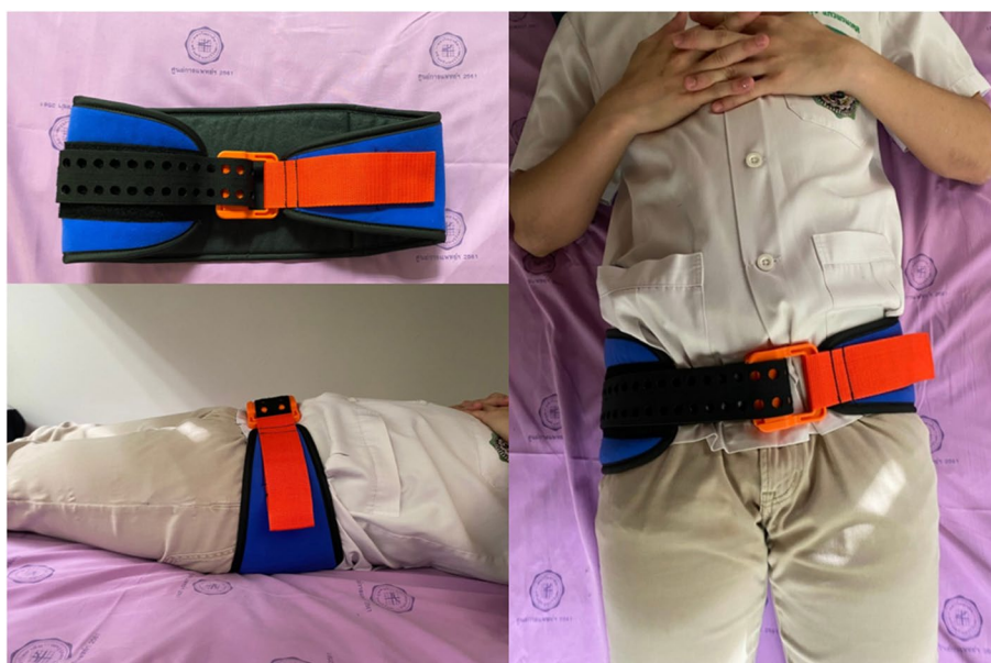
Fig. 1 The SAM Sling® (SAM Medical Products, Wilsonville, OR, USA)

Basic descriptive statistics for categorical data were presented as frequency and percentage, while continuous data were reported as mean and standard deviation in the normal distribution and median and interquartile range in the abnormal distribution. The hematocrit, hospital stays, time to receive X-ray, time to apply binder, and amount of packed red blood cell transfusion were all analyzed using the Mann-Whitney test and the independent