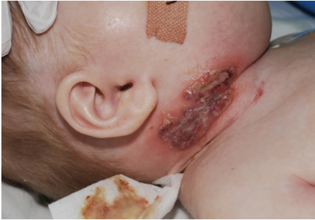
FIGURE 1: 24/12/14: deep violaceous ulcerated area with an undermined border on the right side of neck corresponding to site of arterial line insertion.