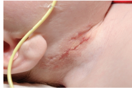
FIGURE 3: 29/12/14: healing with cribriform scarring following treatment with topical clobetasol propionate.

The term pyoderma gangrenosum is coined from the characteristic appearance of these lesions. They begin as pustules or vesiculopustules that progress to an ulcer with undermined borders which evolves into an enlarging necrotic suppurative ulcer after gangrenous changes in the overlying skin. The lesions last from a few months to years and typically heal with cribriform scarring. PG lesions can be classified into ulcerative, pustular, bullous, vegetative, periosteal, genital, infantile, and extra cutaneous [1].