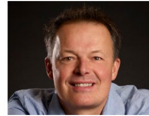
Insight from Bart N. Lambrecht

express the FcRn receptor and were able to induce OVA-specific FcRn hi T reg cells in response to exposure to breast milk-derived OVA Ig-ICs in vitro and ex vivo. Strikingly, mice lacking FcRn selectively in CD11c hi DCs were unable to mount T reg cells and tolerance to food allergens via maternal protection. Ohsaki et al. (2018) finally made an important translational leap and fed humanized FcRn transgenic mice with breast milk of healthy nonatopic mothers. This source of breast milk was rich in OVA-specific IgG4-IC. Although this experiment was performed by oral gavage in adult mice, human breast milk suppressed the salient features of food allergy, including systemic anaphylaxis, suggesting that the mouse findings of the study likely translate to the human situation.