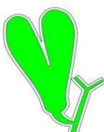
B) Fundic duplication