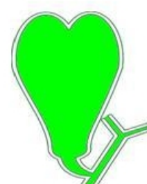
C) Body duplication