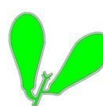
F) Bilateral gallbladders