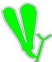
D) Y-shaped gallbladder