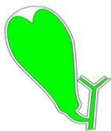
A) septate gallbladder