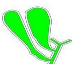
E) Complete duplication