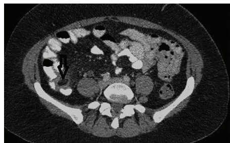
FIGURE 1: Axial CT abdomen with oral contrast showing caecal epiploic appendagitis with minor pericaecal fat stranding (vertical white arrow).

Ultrasonography scan (USS) of the abdomen has some characteristic features to diagnose epiploic appendagitis [8]. Nevertheless, the CT scan is the gold standard of diagnosis [1]. Typical tomographic signs are 2-3 oval-shaped lesions with central hyperattenuation corresponding to a thrombosed draining vein, thickened peritoneal linings, and inflammatory changes within the