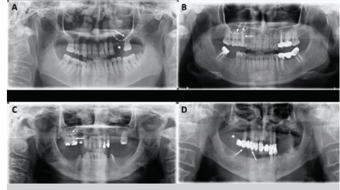
Figure 3. Dental pathologies examples: (a) Dental extractions (asterisk, numbers 24 and 25) and dental root in the maxillary sinus (white arrow: dental apex; dashed line: level of the maxillary sinus floor); (b) Endodontic treatment (straight white arrow) and dental root in the maxillary sinus (dashed white arrows: dental apex; dashed line: level of the maxillary sinus floor); (c) Dental extractions (asterisk, numbers 14 and 15), endodontic treatment (white arrow) and dental root in the maxillary sinus (dashed white arrow: dental apex; dashed line: level of the maxillary sinus floor); (d) Dental extractions (asterisk, numbers 16–18) and dental bridge (white arrows, numbers 13–15)