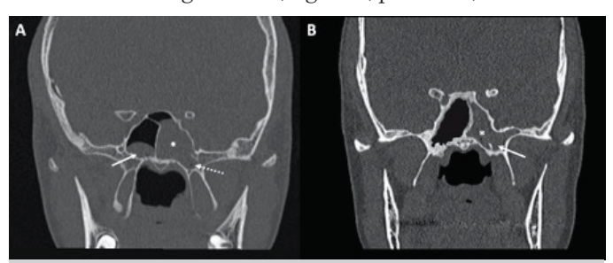
Figure 2. Fungus ball in the left sphenoid sinus (asterisk): (a) Straight white arrow shows mucous retention cyst in the right sphenoid while dashed white arrow shows lateral recess; (b) Straight white arrow shows lateral recess

unaffected sides and there were no significant correlations (p>0.05). Haller cell was more common on the affected side, although Onodi cell was more common on the unaffected side. However, there were no significant differences (p>0.05). Lateral recess was found in 14 of the 24 sphenoid sinuses. Eleven of these were on the same side as FB and this association was significant (Figure 2, p=0.0262).