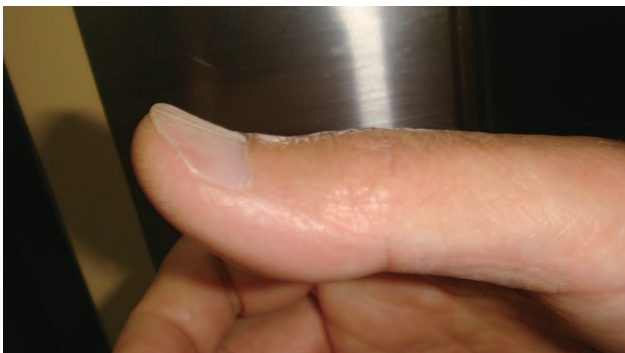
Fig. 2. Typical appearance of koilonychias. The nail plate has a concave form.

Furthermore, koilonychia in the toenails of children is normal: it reflects the immaturity of their nails, which cannot yet withstand normal mechanical forces. 12 These observations indicate that koilonychia may develop when the mechanical force exceeds the nail strength.