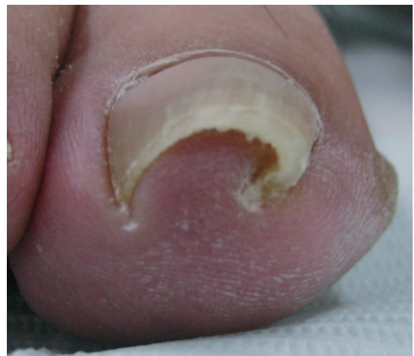
Fig. 3. Typical appearance of pincer nail. Transverse overcurvature of the nail plate is observed.

In our previous studies, we assessed the degree of great toe nail curvature in volunteers who had been bedridden for various durations; moreover, we compared the great toe and thumb nail curvatures of the loaded and nonloaded sides of subjects with unilateral loading due to hemiplegia or fracture. 13 The degree of great toe nail curvature tended to increase as the duration of the bedridden state rose. Moreover, in the unilateral loading cases, the great toe nails on the nonloaded side had a greater degree of curvature than those on the loaded side. Similarly, in hemiplegia cases, the thumb nails on the palsy side were more curved than those on the nonpalsy side. 14 Thus, these studies support the notion that nails can be affected by mechanical forces.