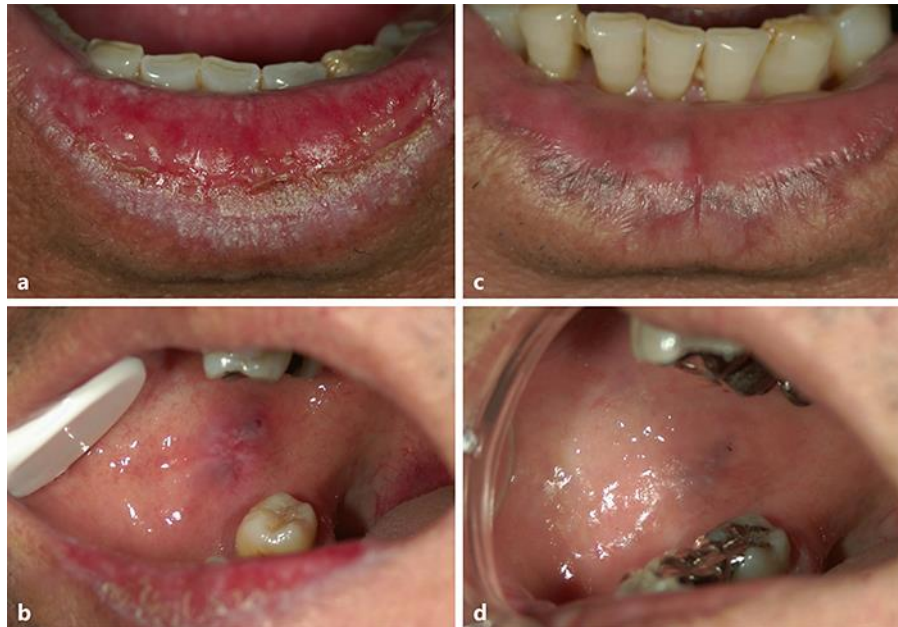
Fig. 1. a Erosive oral lichen planus (OLP) lesions affecting the lower lip of the 53-year-old male at his first visit to Kurume University Hospital (June 2008). b Bilateral buccal mucosa OLP onset in the 55-year-old male (July 2010). c Disappearance of OLP showing postinflammatory melanin pigmentation in the lower lip (December 2016). d Disappearance of OLP showing postinflammatory melanin pigmentation in the buccal mucosa (December 2016).