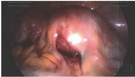
FIGURE 2: Ultrasound of heterogenous right adnexal mass measuring 12.6 \times 8.2 \times 7.9 cm, described as part solid-part cystic in nature.

be densely adherent to the uterus, the right pelvic sidewall, and bowel epiploica (Figure 2). The right fallopian tube and ovary were not able to be visualized and were suspected to be encompassed within the mass. The right ureter was also visibly coursing through the mass. Attempt was made to locate the vermiform appendix but was unsuccessful.