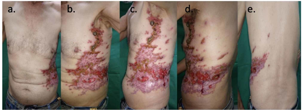
FIGURE 1: Clinical manifestation of zosteriform type metastatic eccrine porocarcinoma of the skin

seven-year-old lesion on the skin of the lateral wall of the left hemithorax. It was initially described as a three-millimeter wart, which was empirically manipulated with its subsequent growth, progressively extending anteriorly and posteriorly in the cephalic and caudal direction, compromising from the armpit to the left flank. In the last two years, it was associated with ulceration, bleeding, peeling, weight loss, and functional limitation due to pain (Figure 1). Because it was initially diagnosed as herpes zoster by its characteristics and distribution, the patient received treatment with topical and oral acyclovir on multiple occasions during the last 12 months without improvement.