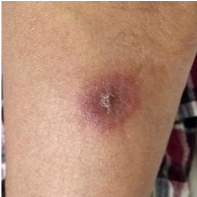
Figure 1 Oedematous erythematous plaques with crusts on the patient's left forearm.