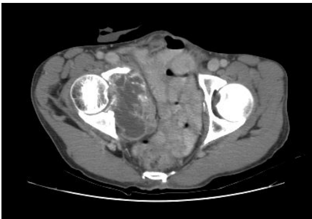
Figure 1 CT scan of pelvis showing a large locally destructive mass lesion. Showing a right sided large heterogeneous pelvic mass with an area of central necrosis with evidence of bone destruction (right acetabular invasion) and distal rectal involvement.

The patient underwent surgical resection of the mass requiring a right hemipelvectomy, end colostomy and a myocutaneous flap closure with penile and scrotal reconstruction. The final pathology revealed an urothelial cell tumor with predominantly low-grade morphologic fea-