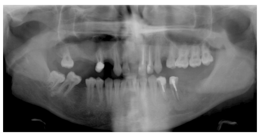
Figure 3. Dental Panoramic Tomograph of the patient after endodontic treatment

Mandibular premolars usually have one root and one canal. However, 2-4 canals have also been reported [11, 12]. Zillich and Dawson [13] showed that the incidence of three-rooted premolars was 0.04%. Rahimi et al. revealed that the incidence of three-canalled mandibular first premolars was 1.2% [14]. In a literature review, Cleghorn et al. (15) found that 0.2% of mandibular first premolars had three roots [11]. At least two radiographs, one right angle and the second at 15° to 20° angle mesial or distal from the horizontal long axis of the root, are required to reliably diagnose more than one root or root canal system [11]. Sudden narrowing of the main canal on a parallel radiograph was a good criterion to judge root canal multiplicity [15]. However, up to 40° mesial angulation from horizontal is required to reliably identifying the extra canals [16]. Deviation of the X-ray angle from the vertical axis of 15° to 30° was effective only in the mandibular first premolar in helping to visualize canal anatomy of premolar teeth. Dadresanfar et al. reported a two-rooted