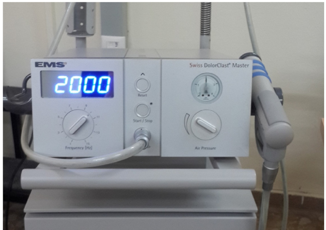
FIGURE 2: Swiss Dolorclast Master Radial Shock Wave device

The device pressure was kept low enough to ensure that pain was tolerable but high enough to have a therapeutic effect. The treatment session was identified as ten sessions twice a week. Ultrasound gel was used for the transmission of shockwaves to the patient's skin. At the end of each session, the patients were suggested to use the finger in daily life activities and no other treatment such as local corticosteroid injection, physiotherapy modalities, orthosis, and surgery was administered during the follow-up period of the study, only they can be using the anti-inflammatory medication. rESWT treatment position was performed as follows: the patients sitting on a chair, with the elbow flexed at 90°, the shoulder adduction beside the body, and the forearm in supination (Figure 3).