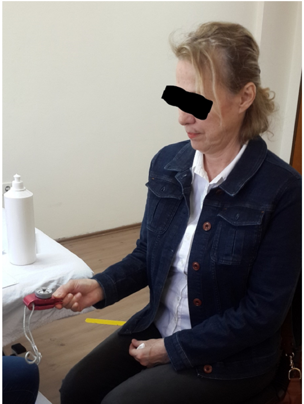
FIGURE 5: Evaluation of pinch strength

Position of patients in pinch meter that used to measure pinch strength for palmar pinch - thumb, index, and middle fingers - was performed as follows: the patients sitting on a chair, with the elbow flexed at 90°, the shoulder adduction beside the body, and the forearm in semi-pronation. Patients performed one of the pinch compressions above with three successive trials for each affected hand. Patients were given a few minutes rest in between compressions to prevent from fatigue. The mean value of the three compressions was taken (Figure 5).