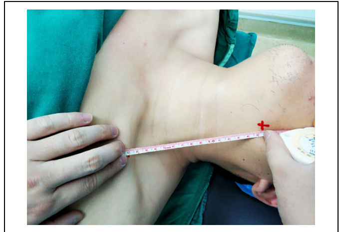
Figure 1. Measurement of neck length.

The Vancouver Scar Scale (VSS) was used to investigate healing of the incision in patients after surgery. The VSS observes 4 physical characteristics of scars: vascularity, pigmentation, pliability, and height. The maximum score is 13, which represents the worst outcome in terms of appearance of the scar. The higher the score of each item is, the worse the patient's satisfaction would be. In addition, all patients were invited to fill out their own questionnaires on their satisfaction with the incision using a 10-point Likert scale (with 1 being very unsatisfied and 10 being very satisfied) 6 months after surgery. Similar scales have been used successfully in previous trials assessing satisfaction. 13,14 Observations and records of the postoperative complications including hypocalcemia, recurrent laryngeal nerve (RLN) palsy, accessory nerve injury, chyle leakage, and infection were collected. After thyroidectomy, all patients were received TSH suppression therapy with levothyroxine and radioactive iodine (RAI) ablation. They were followed up for at least 12 months. Patient follow-up examinations consisted of neck ultrasound and monitoring of serum Tg and TgAb levels every 6 months during suppressive L-thyroxine treatment.