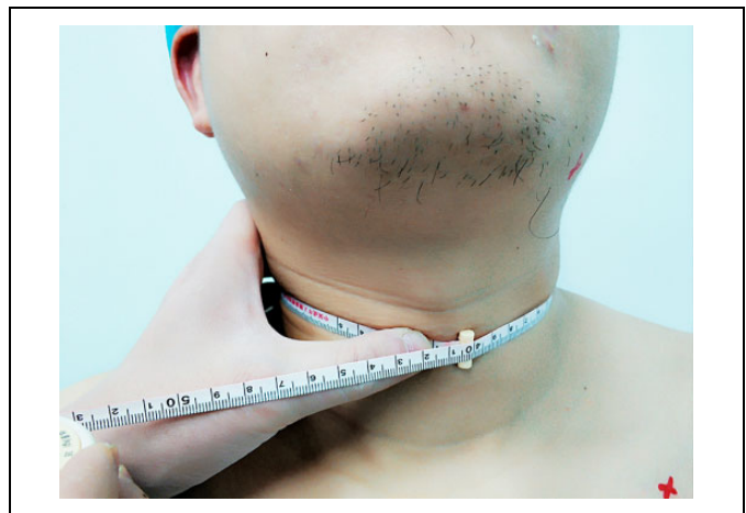
Figure 2. Measurement of neck circumference.