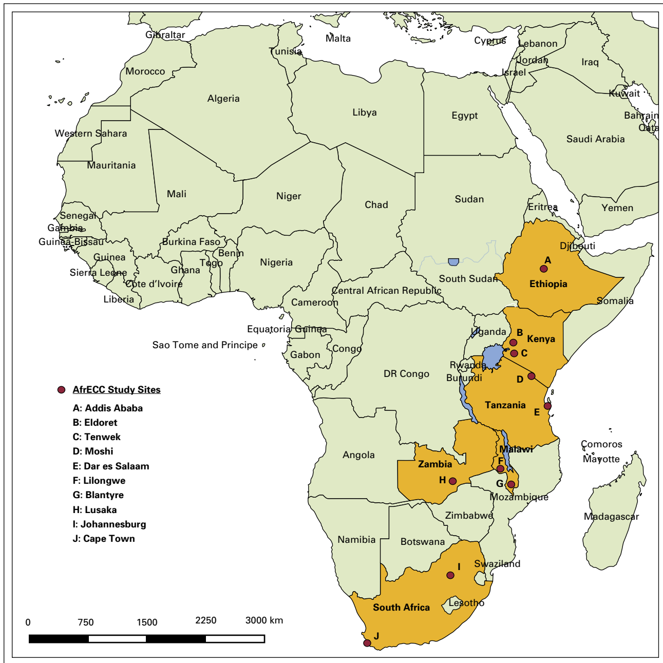
Fig 2. Current participant sites in the African Esophageal Cancer Consortium (AfrECC).

than 40 years, as well as the geographic variation associated with this diagnosis, suggests plausible roles for unique environmental, infectious, and/or genetic risk factors in this region. Identification of environmental, molecular, and genetic factors, as well as possible interactions, that contribute to the high incidence of this disease along the eastern corridor of Africa will be necessary to inform prevention and early detection strategies in this region.