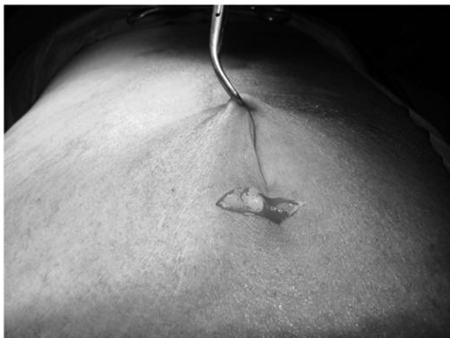
Figure 1. A small 1-cm to 2-cm infraumbilical incision.