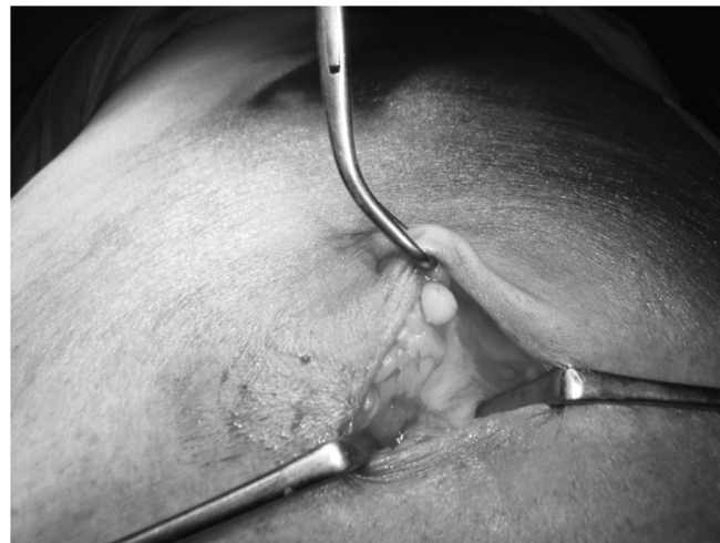
Figure 2. Point of incision at the junction of the umbilical stalk and linea alba.

Medical & Health Sciences, Jamshoro, Pakistan. In a total of 1250 consecutive patients, who underwent various laparoscopic procedures, a simple modified open technique was used in a general surgical department. All operations were performed by 2 surgeons who are experienced in laparoscopic surgery. The open technique used in this series was similar to the conventional Hasson 7 technique with some modifications as follows: