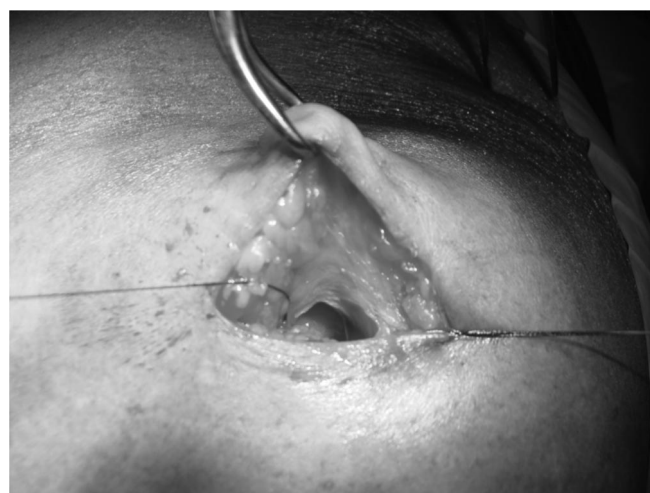
Figure 3. A small incision made in fascia at the junction of the umbilical stalk and linea alba.

A small 1-cm to 2-cm transverse incision is made infraumbilically ( Figure 1 ). After the separation of the subcutaneous tissue, the umbilical stalk is followed up to its junction with the linea alba. Skin edges are retracted by small Langenbeck retractors to identify the point being incised. The correct identification of this point is important, as this is the point where peritoneum is consistently adherent to the overlying fascia ( Figure 2 ). This is in contrast with the original Hasson technique in which an incision is made a little lower down where technically many layers are encountered to get entry into the peritoneum. A towel clamp is applied to the umbilical stalk to retract the umbilicus and abdominal wall. Two stay sutures of Vicryl 1 are placed above and below the point to be incised. These stay sutures are placed just to facilitate closure of the port at the end of procedure. Sometimes, we place these sutures after opening the peritoneum by making small incisions. Whereas, in the conventional Hasson technique, 2 stay sutures are mandatory and incision is made layer by layer. Next, a small incision (<5mm) is made at this point by scalpel or scissors to prevent subsequent loss of insufflation around the cannula ( Figure 3 ). In the majority of cases, this small incision gives direct access into the peritoneal cavity. Alternatively, perito-