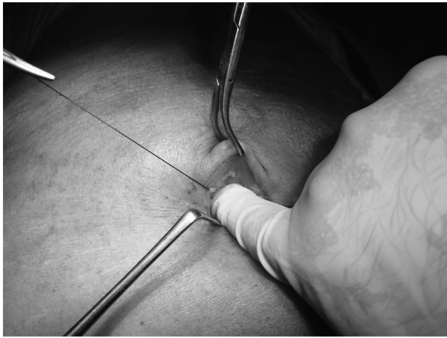
Figure 4. Index finger inserted to dilate the facial incision and to separate peri-umbilical adhesions.