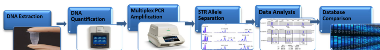
Figure 1. Work flow of STR typing

Most STRs are found in the noncoding regions, while only about 8% are located in the coding regions and their density vary slightly among chromosomes (30). For instance, in humans, chromosome 19 has the highest density