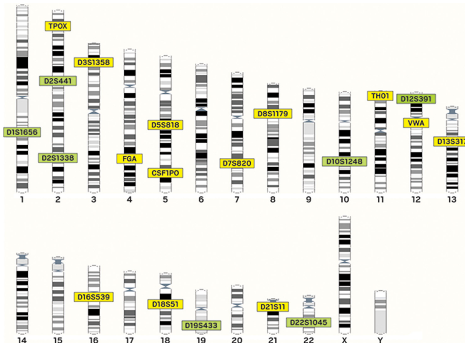
Figure 3. The original 13 STRs highlighted in yellow and seven added in January 2017 highlighted in green adopted (22)

Originally building on the initial FSS work, a European Standard Set (ESS) of STR loci were selected in 1999 and many of the same STR loci used in the United States are also adopted in European forensic DNA laboratories (34, 59). The European community, working through the European Network of Forensic Science Institutes (ENFSI) and the European DNA Profiling Group