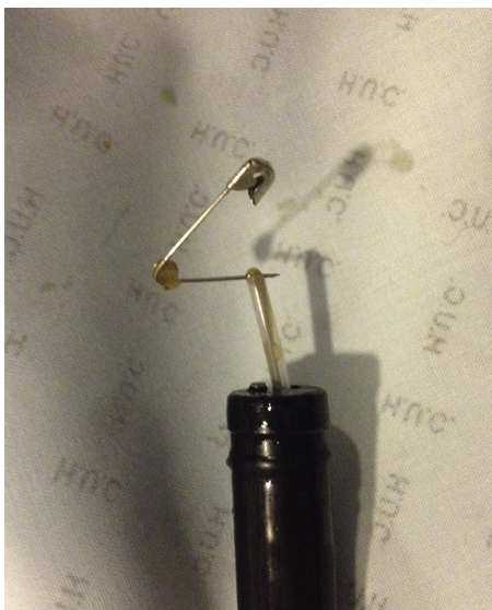
Figure 3 Safety pin secure with a polypectomy snare, after retrieval.

gently removed under direct visualization (Figs. 2 and 3). The procedure occurred without immediate complications and no evidence of pneumoperitoneum in the control X-ray.