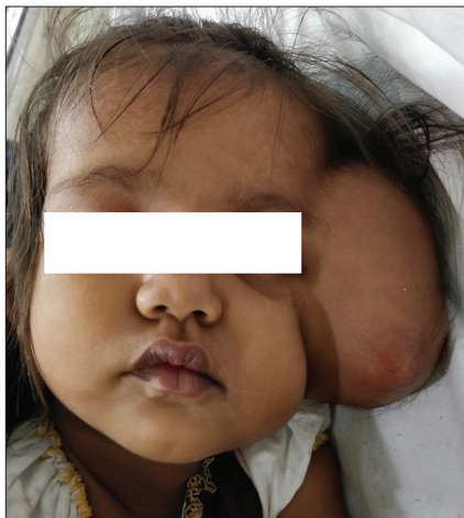
Figure 1: Facial profile of the patient with left temporal mass

Extragenital teratomas are more common in newborns and gonadal predominant in older children. [4] Craniocervical teratomas comprise about 6% of teratomas and occur usually in the neonatal period. Differential diagnosis for craniocervical teratomas are: encephalocele, lymphangioma, cystic hygroma, vascular malformations, large branchial and thyroglossal cysts. [2] The sites in the craniofacial area for teratomas to occur includes 'Extracranial' such as nasopharyngeal area (epignathus), base of the tongue, lateral face, scalp, cheeks and lips; and 'intracranial' such as massive tumours replacing intracranial contents and extending into orbit or neck, small