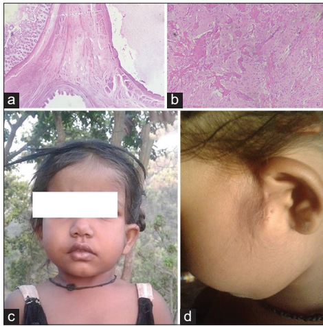
Figure 3: (a) Photomicrograph showing a cystic tumour with squamous epithelium, intestinal and respiratory epithelium. H and E stain, \times 2 view. (b) Photomicrograph showing muscle tissue. H and E stain, \times 2 view. (c) Follow-up at 21 months showing the child's face with no skin laxity. (d) Closer lateral view of the face showing healed scar

CT scan and MRI help in identifying the consistency-cystic or solid; extent of the lesion-extracranial or intracranial; and identifying the distortion/involvement of the surrounding tissues. Of the cases reported, 3 of them underwent CT scan alone, 3 including ours underwent both CT scan and MRI and one had done only MRI.