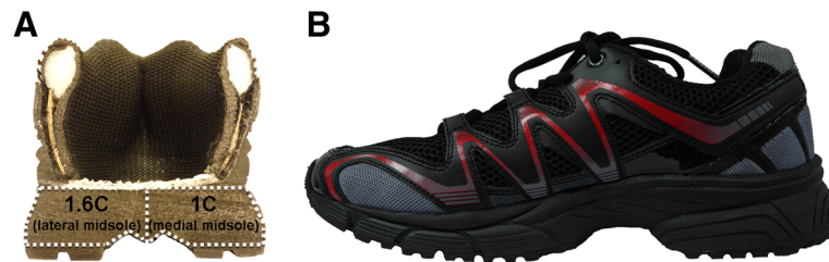
Figure 1 Variable stiffness shoe with the lateral midsole (1.6C) that is 1.6 times stiffer than the medial midsole (1C). (A) section view, (B) side view.

at the characteristic peaks during each dynamic exercise were obtained from the average curves. The average curves were graphed against the percentage stance in the walking case and graphed against time in other three exercises.