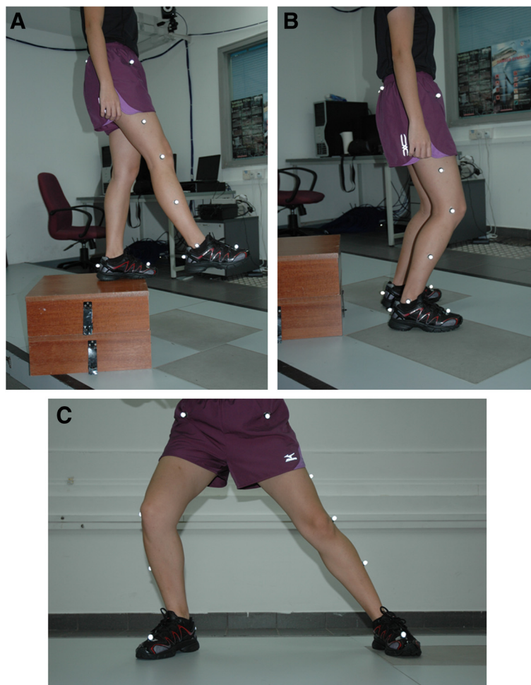
Figure 2 The different dynamic exercises tested in this experiment (A, B) drop-landing, (C) lateral hopping.

In this study, there were no significant differences in walking and running speed between the shod conditions. Walking speed for the control condition was 1.13 \pm 0.17 m/s, and for the VSS condition was 1.22 \pm 0.11 m/s [ p = 0.104 ]. Running speed for the control condition was 2.45 \pm 0.32 m/s, and for the VSS condition was 2.4 \pm 0.33 m/s [ p = 0.149 ]. The EKAM profiles in two shod conditions during the four tested activities are as presented in