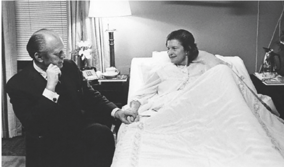
FIGURE 2: President Ford visits First Lady, Betty Ford, at Bethesda Naval Hospital after her mastectomy, 1974. Betty Ford's openness about her diagnosis of breast cancer brought the disease into the public sphere.