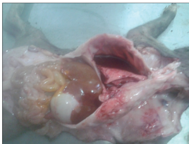
Figure-1: Blood tinged fluid in thoracic cavity of aborted fetus.

Histopathological changes suspected to be of viral infection in samples of female reproductive tract ( n=26 ) and male reproductive tract ( n=6 ) of pig were characterized by focal mononuclear cell infiltration in the endometrial layer and inclusion bodies in uterus, cystic ovaries, and hemorrhage in cortex. These microscopic lesions in female reproductive tract may be due to damage of blastocyst layer resulting in damage to the maternal tissue [4]. However, these lesions can be the outcome of coinfection with other infectious agents