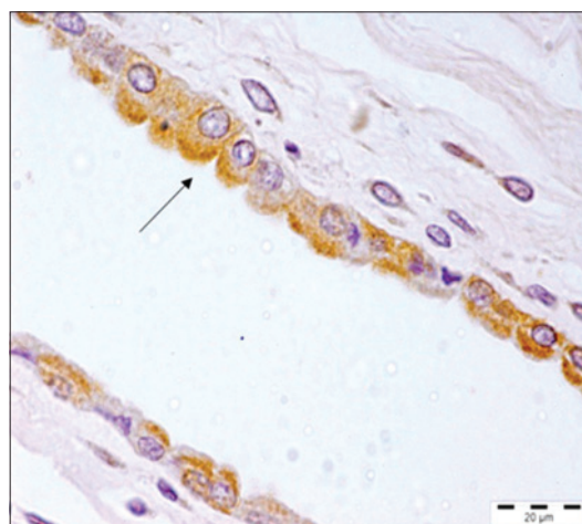
Figure-4: Positive immunoreactivity of Porcine parvovirus antigen in placenta. Immunohistochemistry, Gill's hematoxylin counter stain ×100.