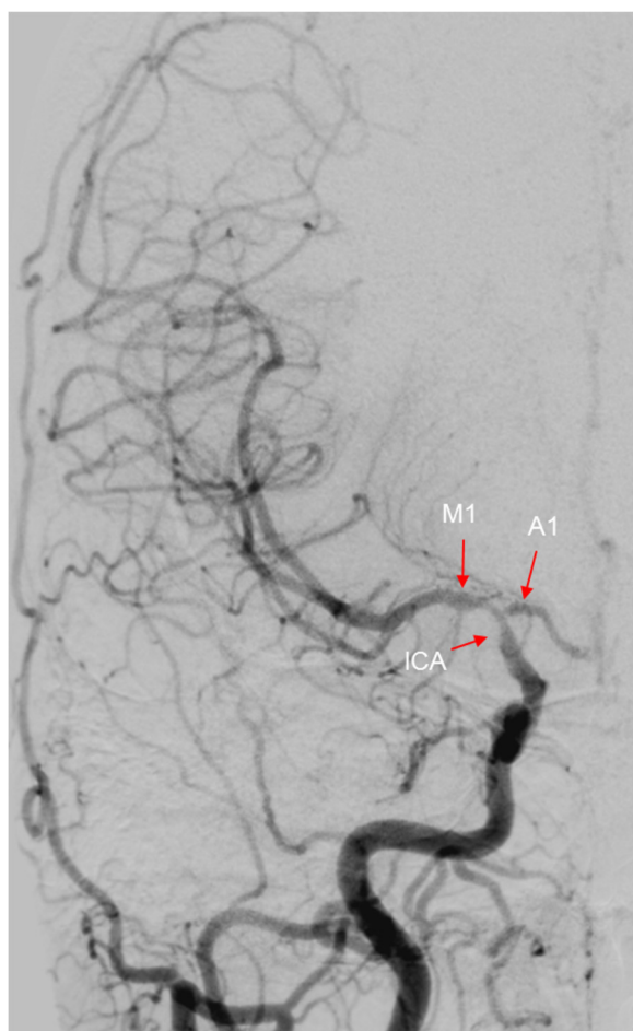
Fig. 3 Digital subtraction angiography of the brain. Multiple stenoses at the internal carotid artery (ICA), middle cerebral artery, M1 segment, and anterior cerebral artery, A1 segment were seen on digital subtraction angiography

each finger exist and are sequentially arranged [6], which means that finger movements are controlled by a highly distributed network rather than by functionally and spatially discrete groups of neurons controlling each finger [7]. This is also supported by the findings of one study, in which none of the patients showed hand motor deficits limited strictly to one or a few fingers, but rather both radial and ulnar sided hand motor deficits in varying degrees. The authors suggested this to be a characteristic form of finger motor deficits due to a cortical lesion which is important to differentiate the clinical picture from lesions at other locations [8]. Clinicoradiological signs observed in our patient exhibiting pseudoperipheral neuropathy due to small subcortical infarction well support motor hand area in the motor homunculus in the hand area.