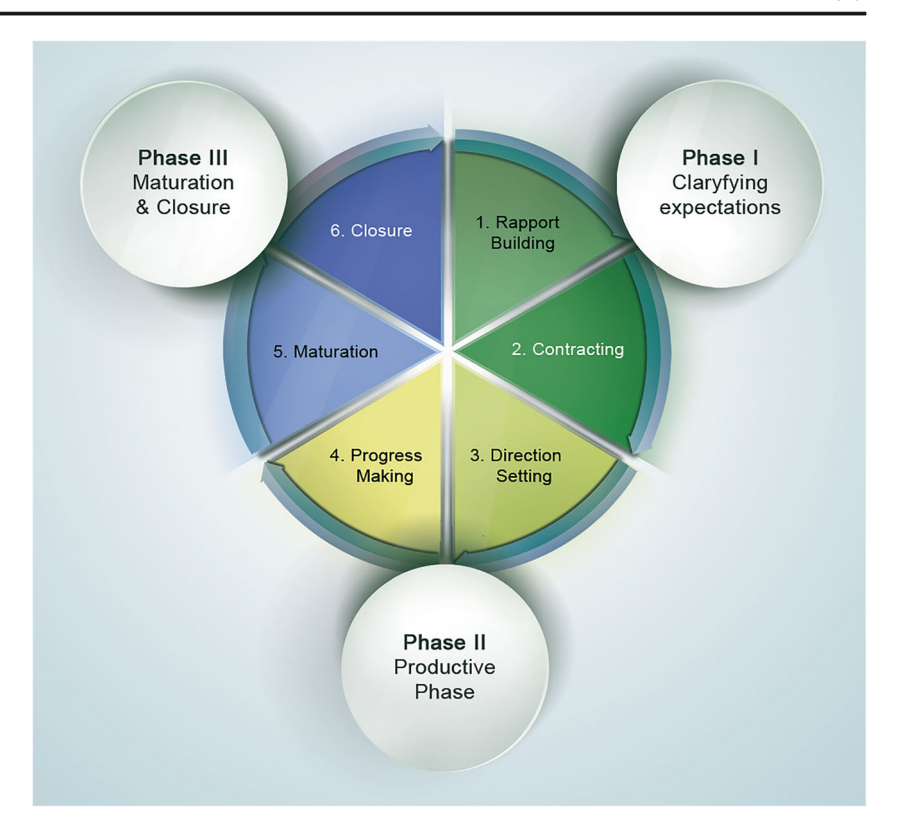
Fig. 4 The mentoring cycle (adapted with permission from UCD People Development & Organisation Effectiveness, Human Resources, University College Dublin, http://www.ucd.ie/hr)

of females in higher positions, women often have mentors with "less organizational clout" [38]. Indeed, research suggests that men help women gain higher-level positions and higher salaries, and women view them as better sponsors due to their connections.