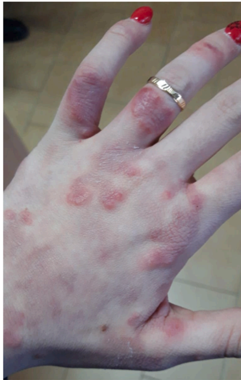
Fig. 1. Maculopapular purpuric lesions of the hands.

at this time revealed erythematous papular-purpuric lesions with the tendency to coalescence into flat-topped plaques localized on the back of the hands. Some of these showed targeted appearance with annular aspect and centrifugal evolution (Fig. 1). Lesions were not pruritic, but painful on palpation.