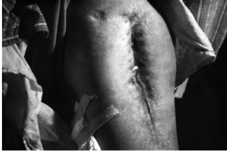
FIGURE 9: A 42-year-old man with multiple suppurative fistulas in his hip joint, under treatment for 4 years (reproduction with permission).