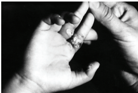
FIGURE 3: A 4-year-old girl with burns on her fingers (reproduction with permission).