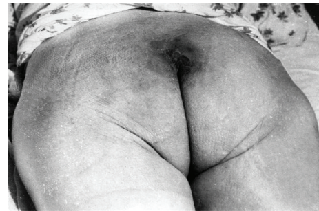
FIGURE 8: The same man after EEP treatment (reproduction with permission).