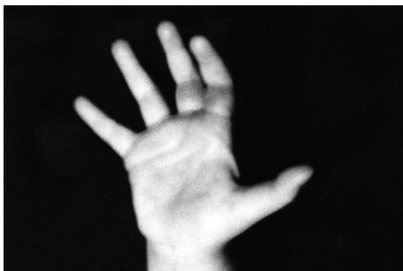
FIGURE 4: The same girl after EEP treatment (reproduction with permission).