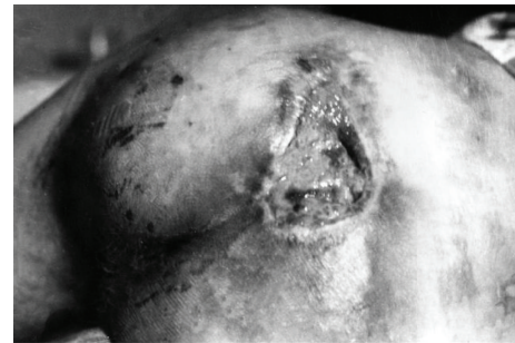
FIGURE 7: A man showing pressure ulcers in sacral bone region (reproduction with permission).