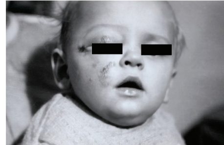
FIGURE 1: A 9-month-old baby showing deep electric burns in its eye and cheek regions.

Furthermore, one of the first analyses concerning clinical efficacy of propolis which was prepared and applied in accordance with the Scheller's method was described in 1975 [1], whereas the clinical material description concerned the cases of the poor and chronic non-healing wounds, in 100 patients treated between 1972 and 1974, in the Department of Dermatology in Hospital No. 2 in Bytom, the Clinic of General Surgery of the Silesian Medical Academy in Bytom, and the Clinic of Orthopedic Surgery of the Silesian Medical Academy in Bytom. The research which concerned the above mentioned group of was conducted by Dr. Kubacka under the leadership of professor Scheller [1]. The target group, who underwent clinical assessment, consisted of 12 patients with burns, 30 with venous crural ulceration, 10 with local sacral bone pressure ulcers, 23 with suppurative osteitis and arthritis, 15 with suppurative postoperative local wound complications, and 10 with infected traumatic wounds. All