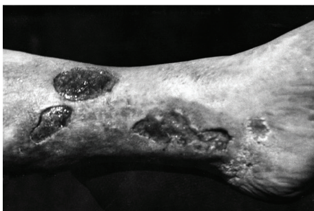
FIGURE 5: A 59-year-old woman showing venous crural ulceration, under treatment for 10 years (reproduction with permission).

The chronic osteomyelitis and arthritis in lower limbs were accompanied by multiple fistulas, in one case, and even 20 fistulas were recorded. What would be worth noting is that 8 of the patients had been unsuccessfully treated for a few months, in the period of 5 years. Yet 15 of them were successfully cured after the application of the EEP therapy. The examples are presented in Figures 9 and 10.