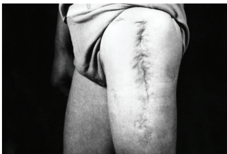
FIGURE 10: The same man after EEP treatment (reproduction with permission).

at all. All in all, the described material, which included 100 patients treated in accordance with the method put forward by Scheller, revealed that 66% of the wounds were thoroughly healed, 21% were significantly alleviated, and only in the 13% of cases the failure was noticed, mainly in the group of patients with osteomyelitis, crural venous ulcer, or pressure ulcer [1].