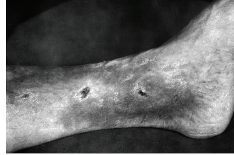
FIGURE 6: The same woman after EEP treatment (reproduction with permission).